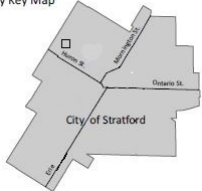
City Key Map

The City of Stratford Council will hear the following applications at a public meeting to be held on Monday, July 23 2018 at 6:00 p.m. in the Council Chambers in City Hall, 1 Wellington Street, Stratford to hear all interested persons with respect to the zone change applications under Section 34 of the Planning Act, R.S.O. 1990.