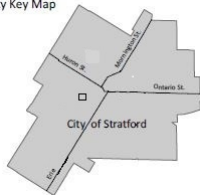
City Key Map

The Stratford Committee of Adjustment will consider the following application at a hearing to be held on Wednesday, July 11, 2018 at 5:00 p.m. in the Avon Room, City Hall Annex, 82 Erie Street, Stratford: