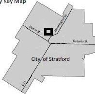
City Key Map