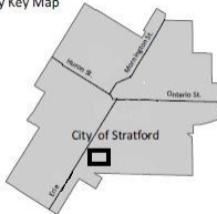
City Key Map

For those persons who wish to participate orally at the meeting, please contact the Secretary Treasurer at planning@stratford.ca no later than 10:00 am on Thursday March 17, 2021.